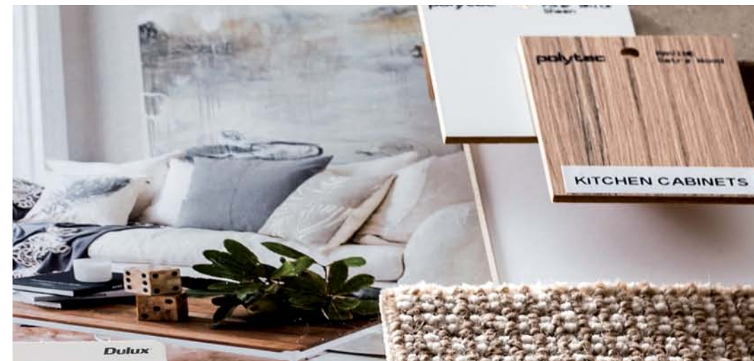
Melissa Redwood - Interior Designer

MY ROLE IS TO... select the tiling, paint colours, cabinetry, floor covering, lighting and window treatments for Webb & Brown-Neaves display homes. I also purchase all the furniture, homewares and artwork, and prepare the display homes ready for opening to the public.